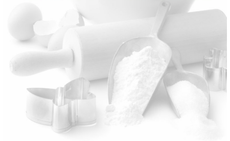
Net proceeds benefit WV Credit Union Designated Fund of The National Credit Union Foundation