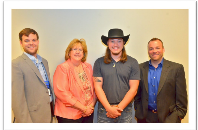
Friday banquet entertainment sponsor VolCorp CU meets NBC's The Voice contestant Cody Wickline, a Raleigh Co. native son who performed on Friday evening.