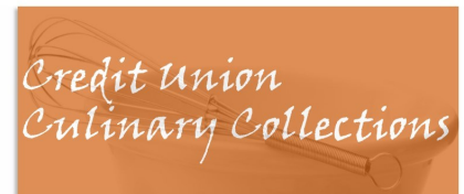
Family recipes from West Virginia’s Credit Unions